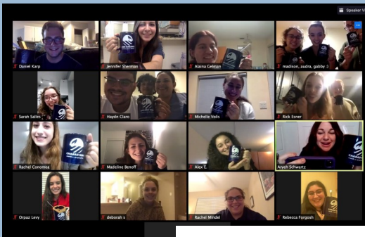
PREP FOR ROSH HASHANA WITH A VIRTUAL HONEY CAKE MUG BAKE