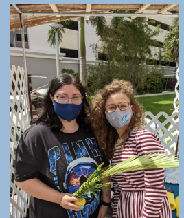
BRINGING SUKKOT TO STUDENTS