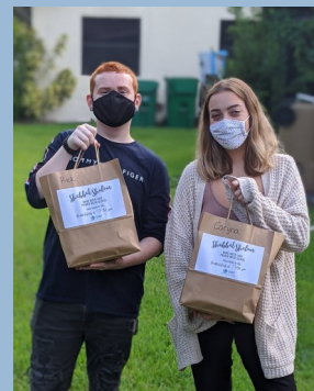
INNOVATIVE DIY SHABBAT-TO-GO