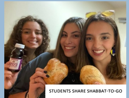
STUDENTS SHARE SHABBAT-TO-GO