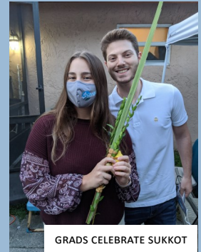
GRADS CELEBRATE SUKKOT