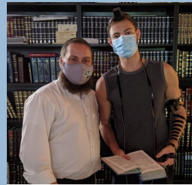
GETTING HIS OWN PAIR OF TEFILLIN!