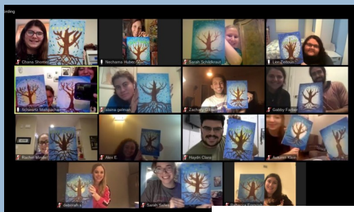
VIRTUAL PAINT PARTY