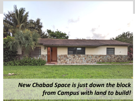
New Chabad Space is just down the block from Campus with land to build!

Send checks to Chabad at NSU, address below.