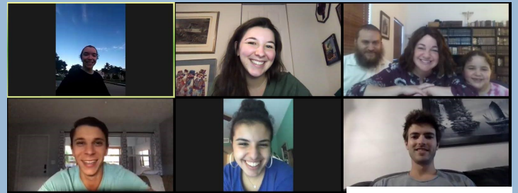
PRE-SHABBAT ZOOM CHECK IN