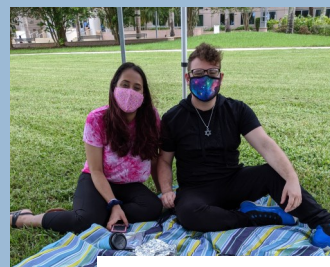
PITA & PARSHA ON CAMPUS