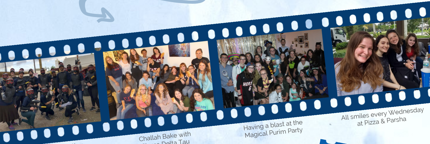
Paintball Shooting with the NSJew Crew