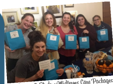
Supper & Study ~Midterms Care Packages