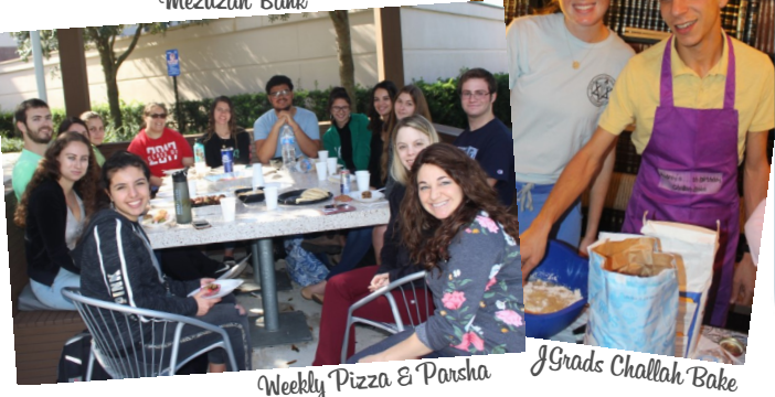
Weekly Pizza & Parsha JGrads Challah Bake