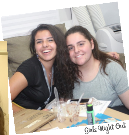
Girls Night Out